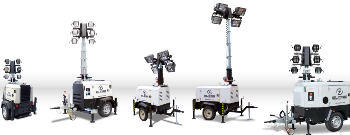
Mobile Lighting Towers with Diesel Generator Torri faro mobili con Generatore Diesel