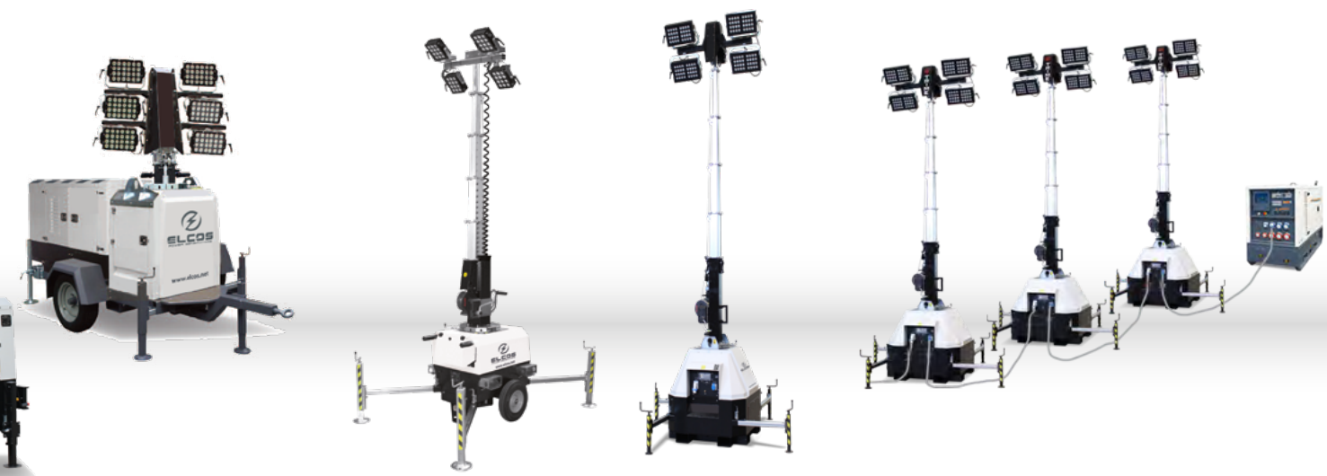
Lighting Towers with Generator predisposte per Generatore