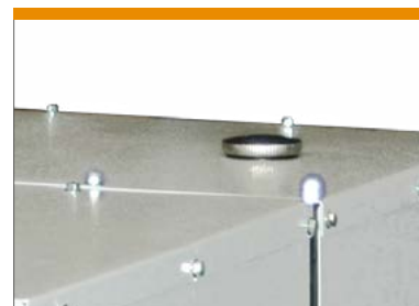
TANK REFILLING POINT BOCCHETTONE SERBATOIO