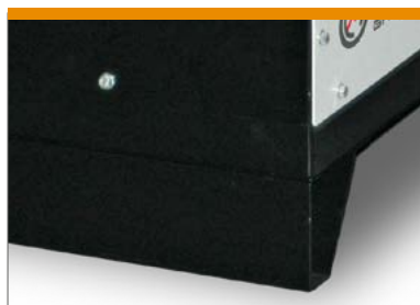
SELF SUPPORTING FRAME TELAIO AUTOPORTANTE