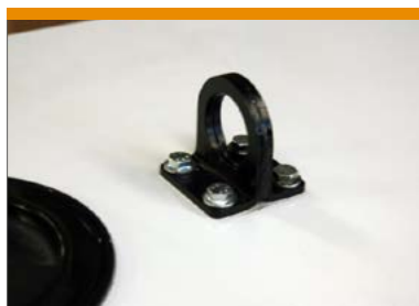
LIFTING HOOK GANCIO DI SOLLEVAMENTO